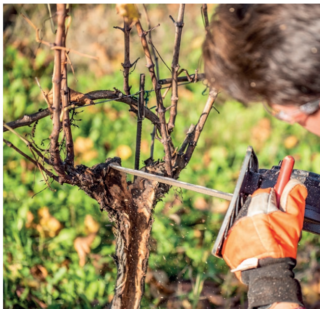
Figure 3. Illustration of the curettage technique, performed on a grapevine stock with a small chain saw.