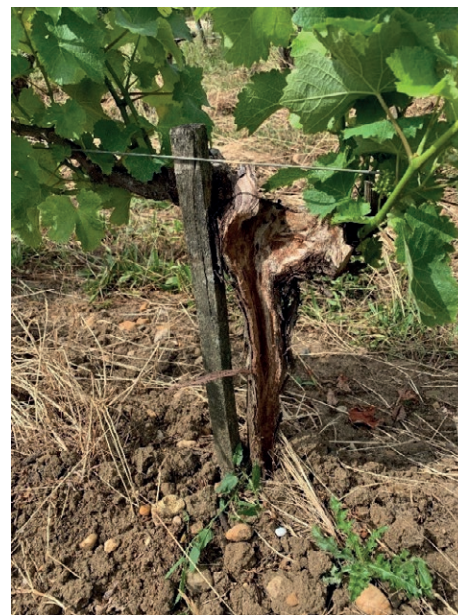
Figure 2. Examples of ‘Sauvignon Blanc’ vines curretted in the Couhins III-7 vineyard.