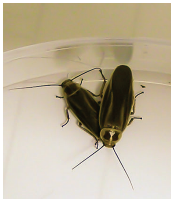
Figure 1. Male (left) and female (right) Schultesia nitor .

copulation (e.g., N. cinerea ; Roth 1962, 1964a). Monandry can also arise from abiotic constraints. In Pieris napi for instance, females exhibit two mating strategies: they can either be polyandrous or monandrous. Although these differences are under genetic control (Wedell et al. 2002b), monandry in this species has been shown to be selected in populations facing unfavorable weather conditions (Välimäki et al. 2006).